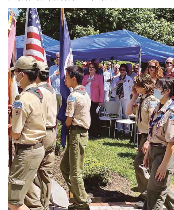
BSA Troop 55 of Great Falls presents the colors