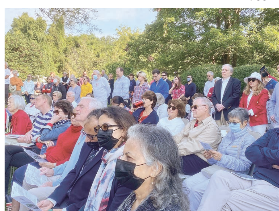
On the 20th anniversary of 9/11, the community gathers for the program of events at the Great Falls Freedom Memorial 9/11 Ceremony held Sat., Sept. 11, 2021.