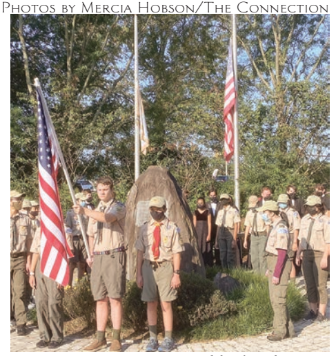
Scout Troop 55, supported by its chartering organization St. Francis Episcopal Church in Great Falls, presents the colors during the program, and leads the Pledge of Allegiance.